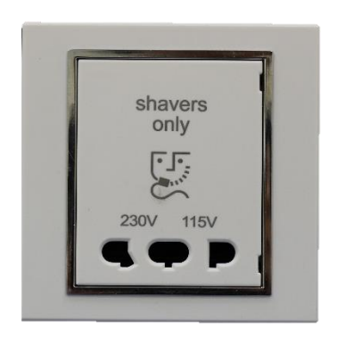
JC8668-W + JC1111 (Frame)